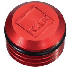
Accepts magnetic accessories