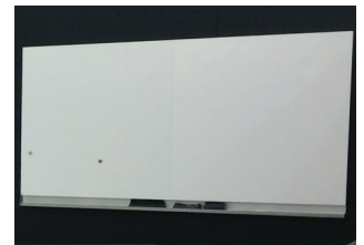
Available in LINXX installation.