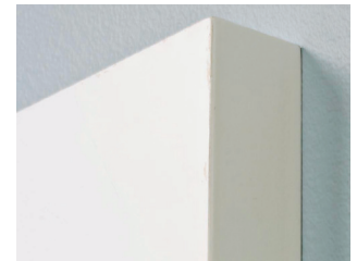
Monolithic construction with vanishing edge.