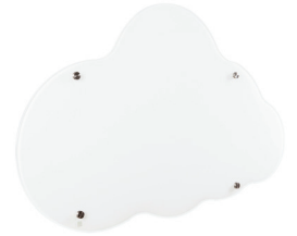
Clear, frosted, or colored glass