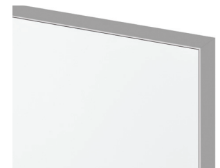
3/4" deep Clear Anodized Aluminum frame