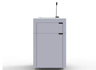
Make an intelligent statement about your presentation.