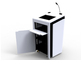
Storage for additional options.

With room for options - a cup holder, a microphone, room controls - the presenter enjoys complete control of their environment.