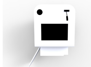
Interactive touch screen flat-panel.