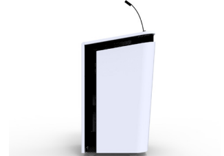
Modern and sleek aesthetic.

Environmentally responsible through design, quality, value, and timeliness: Egan has been certified to have established and maintained a Quality Management System and Environmental Management System, which are registered to the ISO 9001:2008 and ISO 14001:2004 standards. Designed and manufactured in North America by Egan Visual Inc., leaders in visual communication products for the contract furniture industry for over 40 years. You can count on Egan products to be well-designed and well-built for years of hassle-free enjoyment.