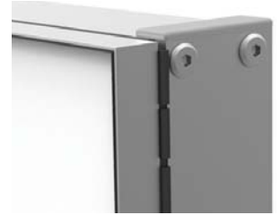
Ultra-thin Boxcore door bezel