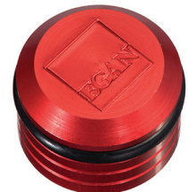
Egan NeoMagnet compatible