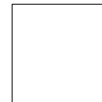
Square Corner (S)