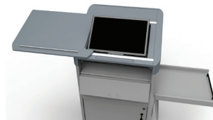
Optional finger touch monitor and sliding document tray/monitor reveal.