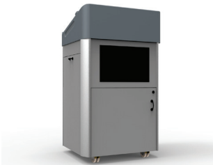
Optional audience-facing logo/agenda