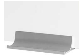
VersaPalette stand for quick display